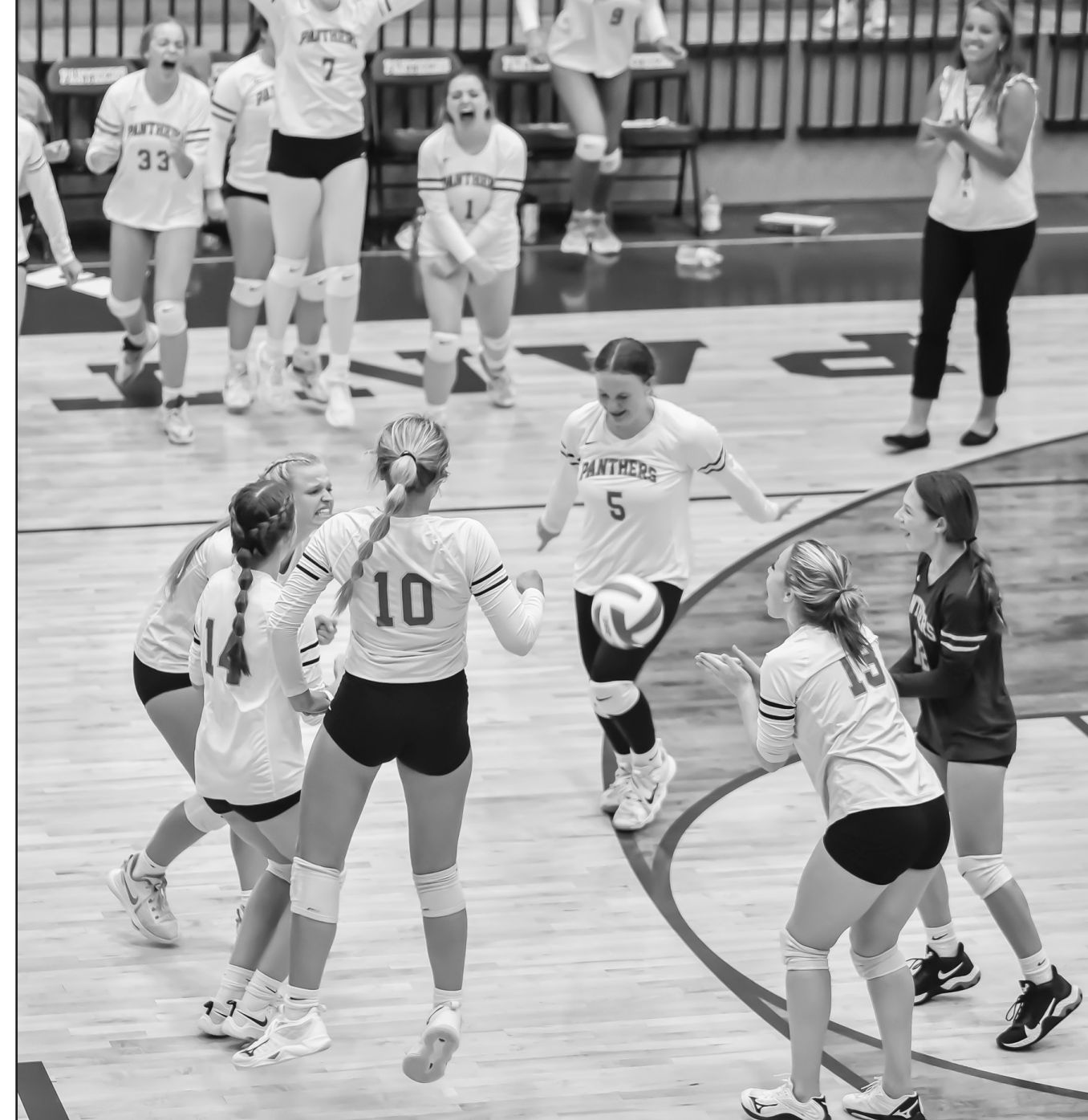
Union County volleyball celebrates last week's 2-1 victory over Providence Christian.

Union traveled to Andrews, North Carolina on Monday, Sept. 11, before resuming region play Tuesday at East Jackson. The Panthers visit Providence on Thursday for a tri-match involving Whitefield