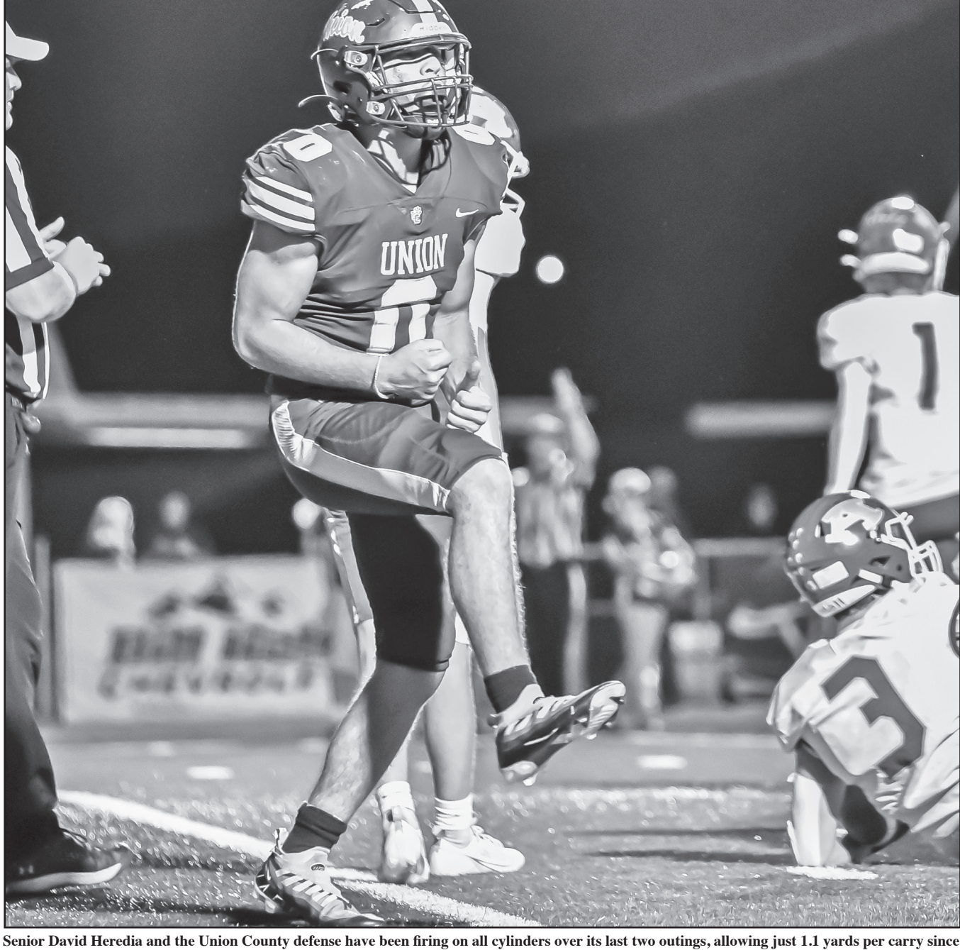
the loss at Lumpkin County.

school-record performance of 233 yards vs. Social Circle.