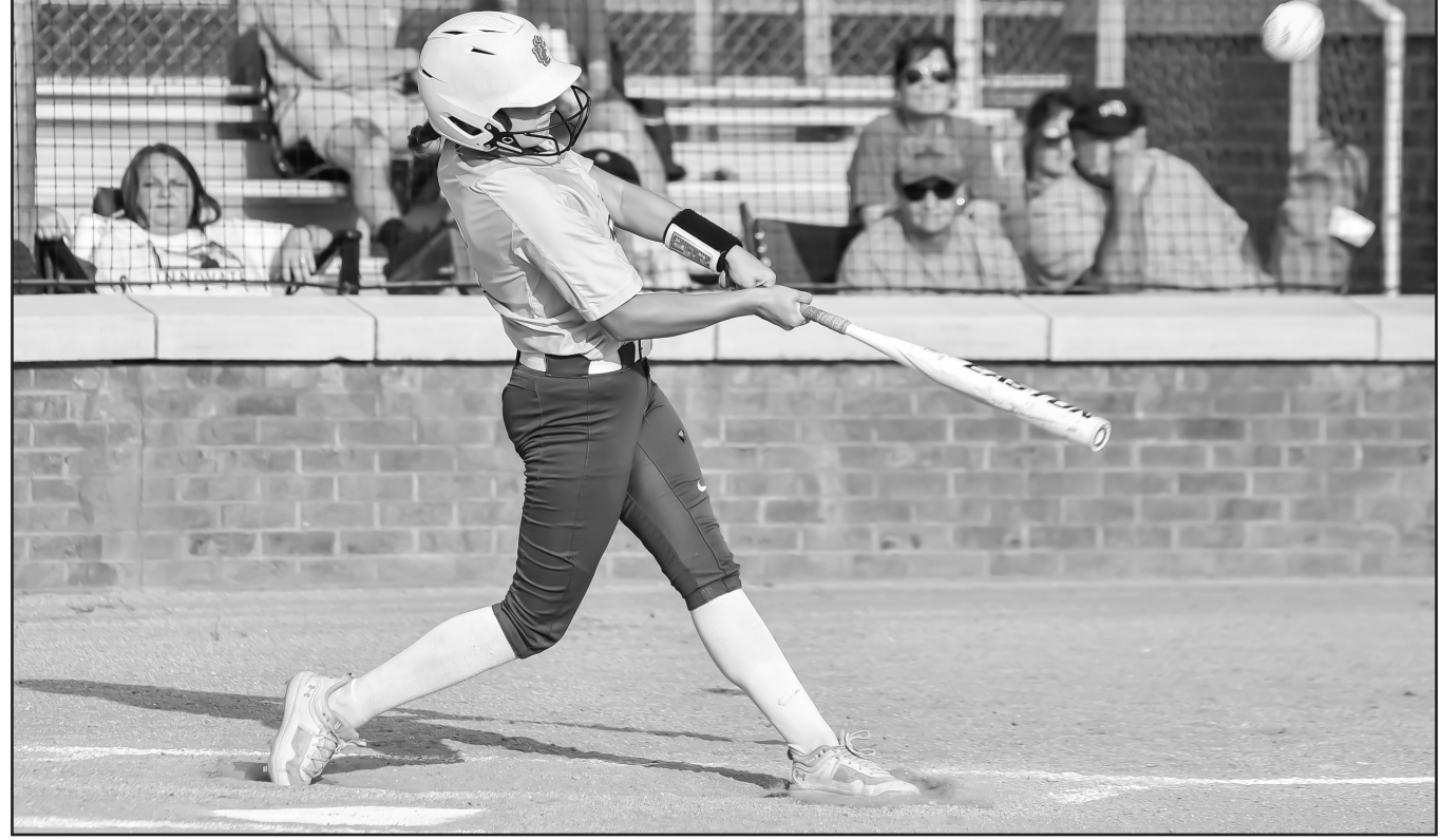
high school career.